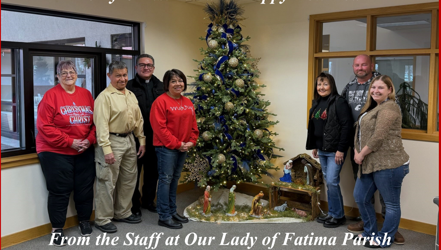
From the Staff at Our Lady of Fatima Parish