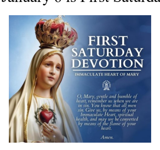
First Saturday Rosary 7:30 am Mass 8:00 am