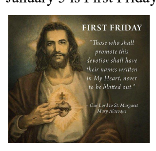
First Friday Masses 7:00 am (English) 6:00 pm (Spanish)